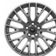
Optional 5.0L V8 19" alloy wheels with Lustré Nickel finish*