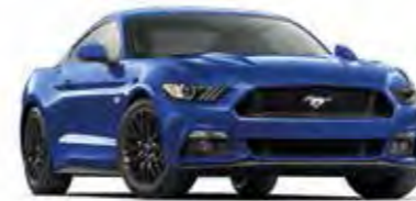
Deep Impact Blue*