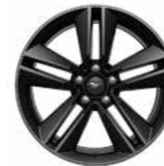
Standard with 2.3L EcoBoost 19" alloy wheels