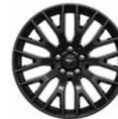
Standard with 5.0L V8 19" alloy wheels