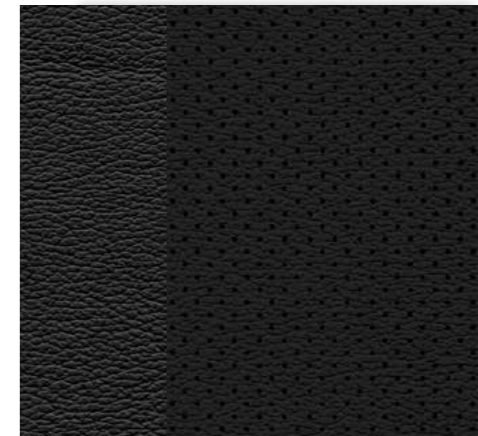
Ebony Leather with Perforated Inserts