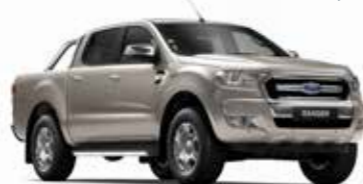
Oyster Silver (Metallic*)