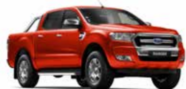
Colorado Red (Solid)