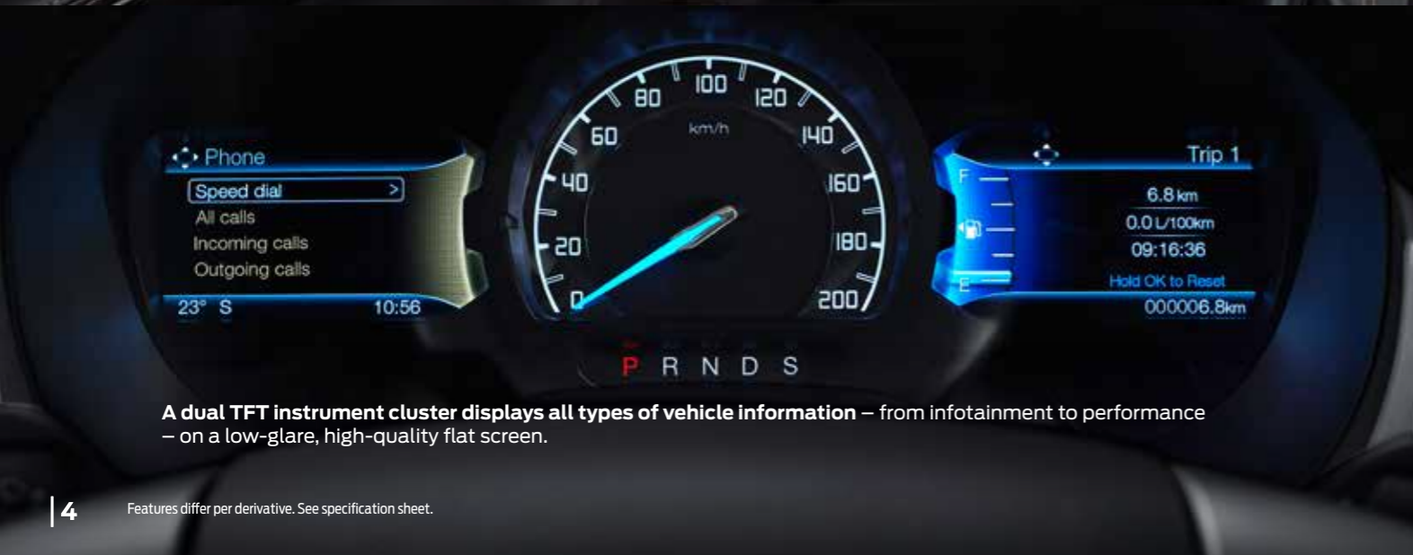
A dual TFT instrument cluster displays all types of vehicle information – from infotainment to performance – on a low-glare, high-quality flat screen.