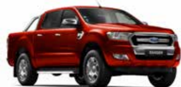
Copper Red (Solid)