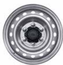
16" Steel wheels