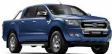
Ocean Blue (Metallic*)