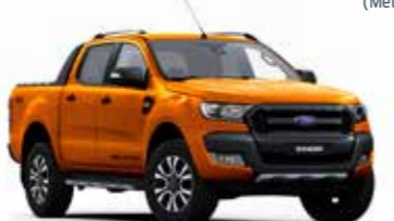
Pride Orange (Metallic*)