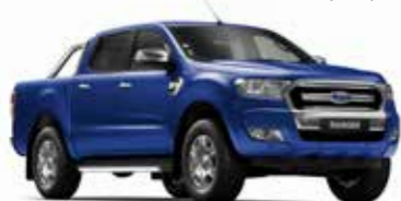
Performance Blue (Metallic*)