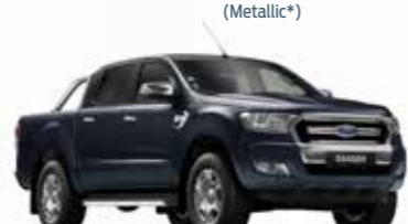
Sea Grey (Metallic*)