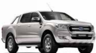
Moondust Silver (Metallic*)