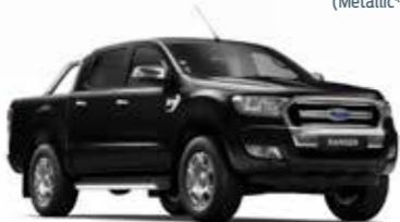
Panther Black (Metallic*)