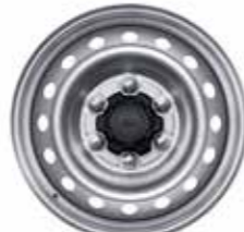
17" Steel wheels