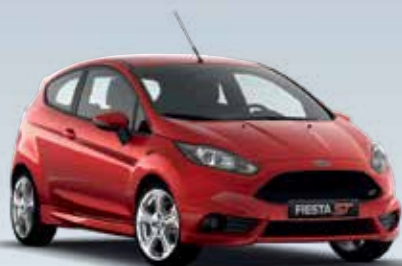
Race Red (Solid)