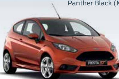
Molten Orange (Metallic*)

*Metallic body colours are options at extra costs.