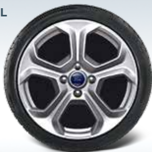
17" Alloy wheel 205/40/R17