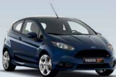
Solid Blue (Metallic*)