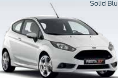
Frozen White (Solid)