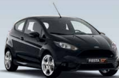
Panther Black (Metallic*)